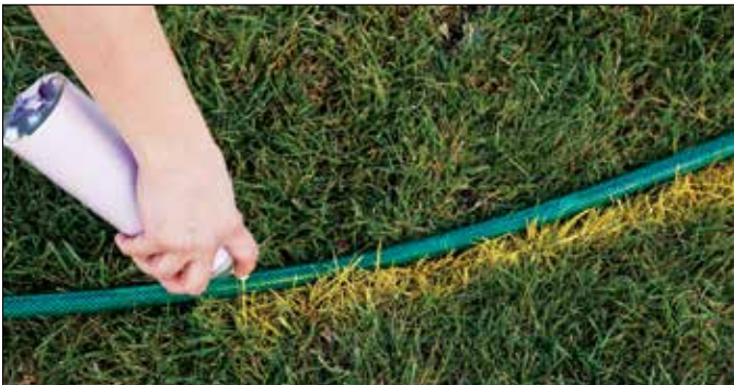
Mark & Dig

Mark an outline of your project. Then dig a shallow trench 3" (76mm) deep by 6" (152mm) wide to receive the edging unit.