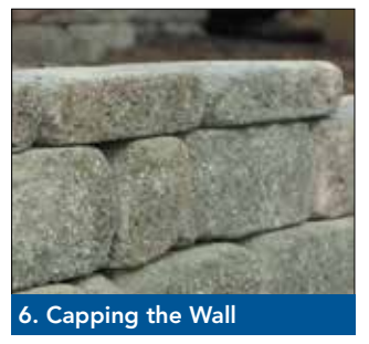
Continue all steps until ready to place the wall cap. Clean off the last course in preparation for the cap or coping to finalize the wall. With units dry and clean, use construction adhesive to secure the caps to the units. Install the Stonegate Country Manor 3" (75mm) capping unit, architectural precast concrete or cut stone as a coping element. Cap may be flush or overhanging as required by aesthetics and design.

Place the next course of units over the fiberglass pins, fitting the pins into the long receiving channel recess of the units above (Note: Some removal of debris in the pin holes and channel may be necessary prior to placement). Push the units toward the face of the wall until they make full contact with the pins. If pins do not connect with channel but align in open core of upper unit, place drainage fill in core to provide unit interlock with pin. For near vertical alignment, center the unit above over the center placed pins below.