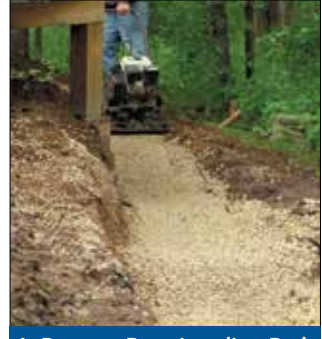
Prepare Base Leveling Pad

Remove all surface vegetation and debris. Do not use this material as backfill. After selecting the location and length of the wall, excavate the base trench to the designed width and depth (min. 20" w x 12" d) [500mm x 300mm]. Start the leveling pad at the lowest elevation along wall alignment. Step up in 6" (150mm) increments with the base as required at elevation changes in the foundation. Level the prepared base with 6" (150mm) of well-compacted granular fill (gravel, road base, or ½" to ¾" [10 - 20 mm] crushed stone). Compact to 95% Standard Proctor or greater. Do not use PEA GRAVEL or SAND for leveling pad.